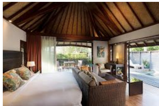
Hotel Hilton Moorea Lagoon Resort & Spa