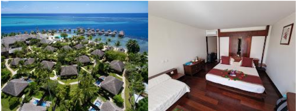
Hotel Manava Beach Resort & Spa

Hotel Manava Beach Resort & Spa - 3 Nights in a Garden View Room, with daily American Breakfast included