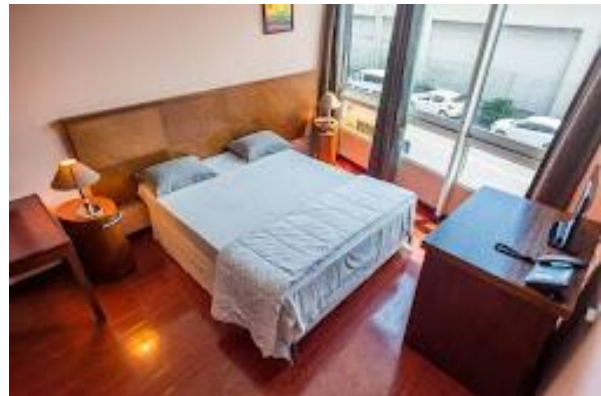
Hotel Sarah Nui – standard Room with Queen Bed and daily continental breakfasts