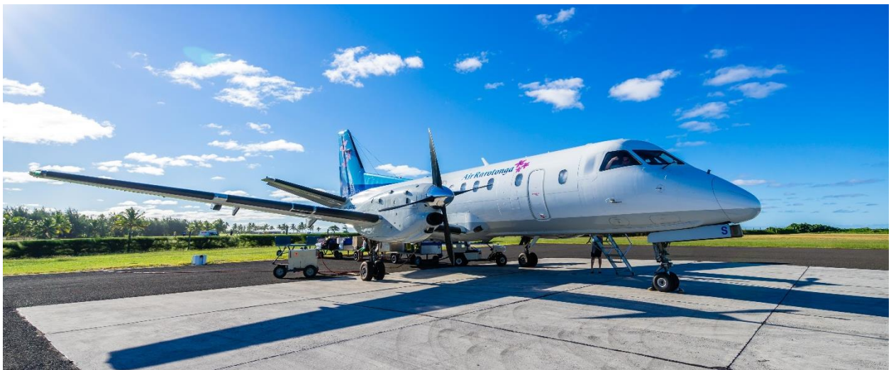
Air Rarotonga's SAAB as above - pictured at Aitutaki airport (Cook Islands)

Flights to and from Papeete is operated by Air Rarotonga's 34-seater SAAB aircraft which at this stage will only carry a maximum of 28 passengers.